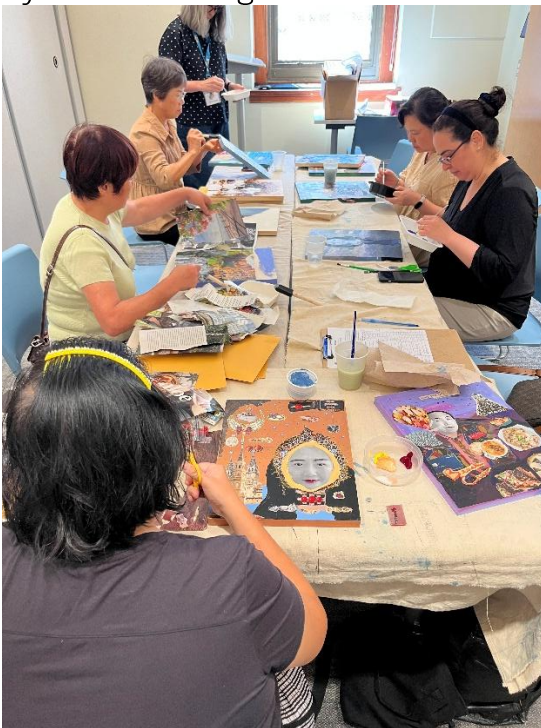
A collage workshop creating art for Indivisible: Stories of Strength