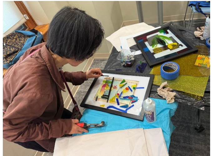
An artist at work in a mosaic glass workshop