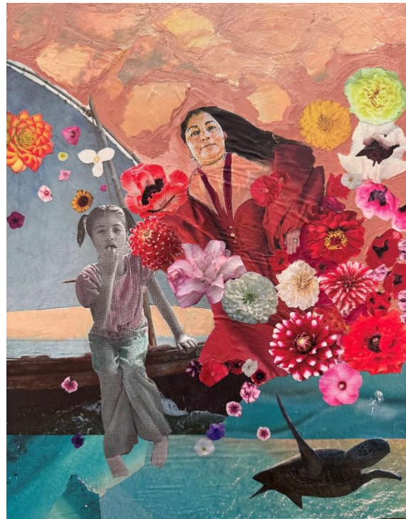
Mixed media collage, Marta Cruz, Mexican