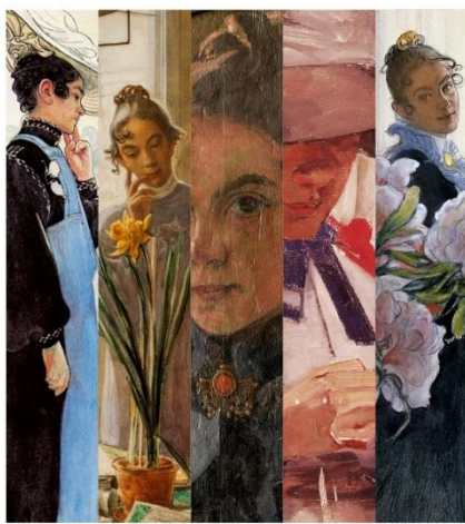
AMERICAN SWEDISH HISTORICAL MUSEUM