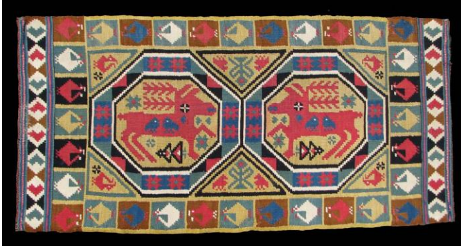
Interlocked Tapestry agedyna (bench cushion), undated, with reindeer in octagons, flanked by birds with floral forms. Collection of Wendel and Diane Swan.