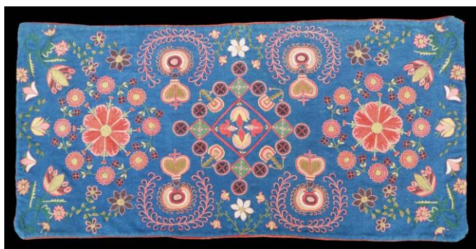
Embroidered agedyna (bench cushion), undated, with polychrome segmented medallions, hearts, crosses, and floral motifs. Collection of Wendel and Diane Swan.