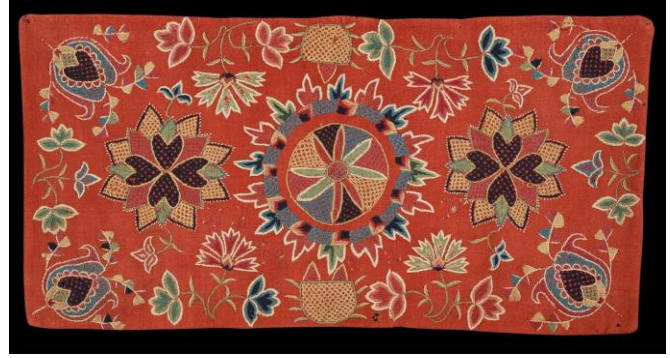
Flamskväv agedyna (Flemish weave cushion), dated 1822, with a red ground, undulating flowers and a central multicolor spiral star. Collection of Wendel and Diane Swan.