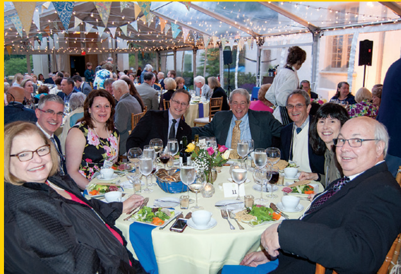
▲ We had a fantastic time at our annual fundraiser Spring Ting in early May!