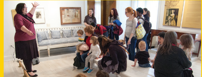
▲ Children got to reinforce their knowledge of the five senses through interactive stories and music movement during our 'Five Senses' themed Toddler Time in March.