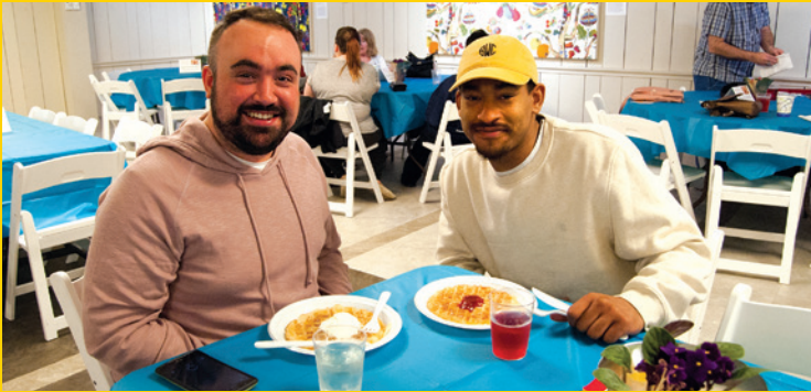
► Waffle day on March 25th called for delicious Swedish waffles, with lots of strawberry jam and whipped cream! Yum!