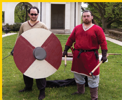
◀ At this year's Viking Day, we got to learn all about Viking fighting techniques during East Coast Combative Arts' historic weapons demonstration.