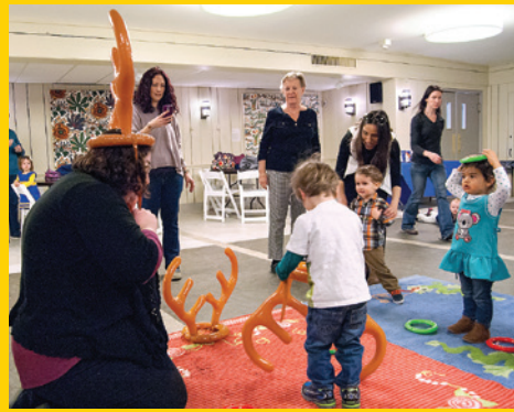
◀ During Toddler Time in February, children got to walk in the tracks of moose around the Museum galleries, and then create their own animal tracks and moose puppets!