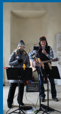
▲ The Last Chance Band playing at the Outdoor Christmas Market