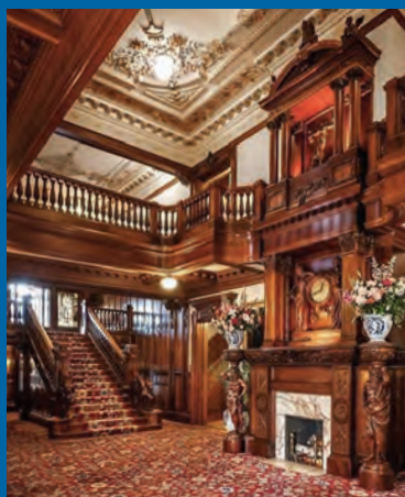
▼ Our first Virtual Field Trip Friday toured the Turnblad Mansion in Minnesota.