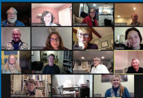
▲ Swedish Language Beginners class meeting in November.