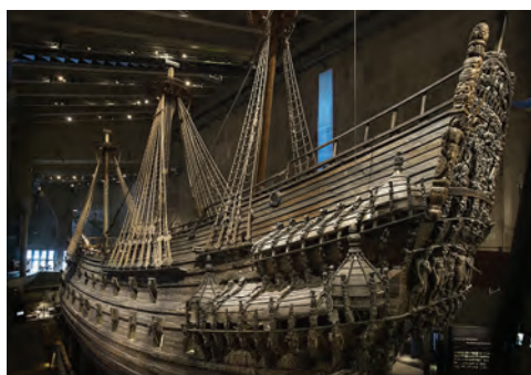
View of the Vasa Ship at the Vasa Museum in Stockholm, Sweden.

Each program is 45 minutes long over the lunch hour so you can take a break from your day, whether at home or work, to be immersed in a Scandinavian cultural experience. These trips will allow you to