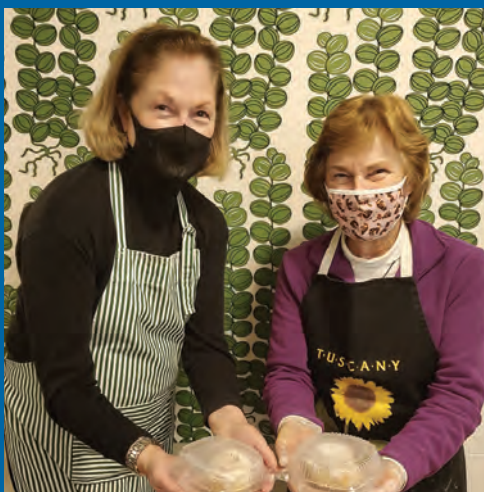
▲ Volunteers showing seniors ready-to-go.