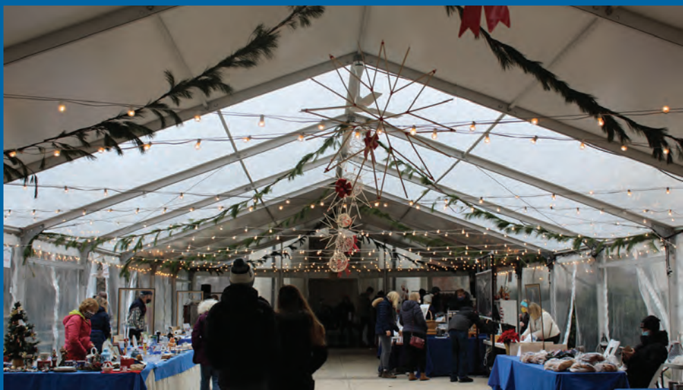
▲ Shoppers at our Outdoor Christmas Market