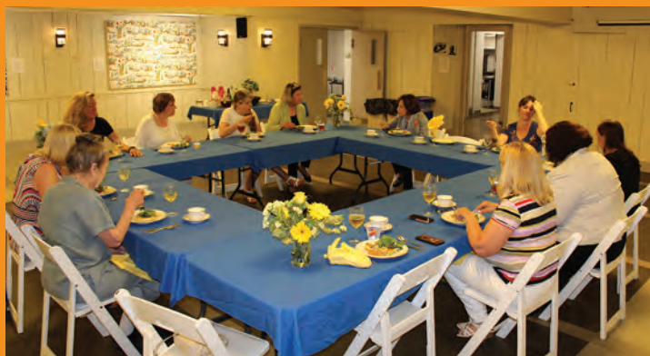
▲ The Spring Ting Committee gathered for a thank you luncheon.