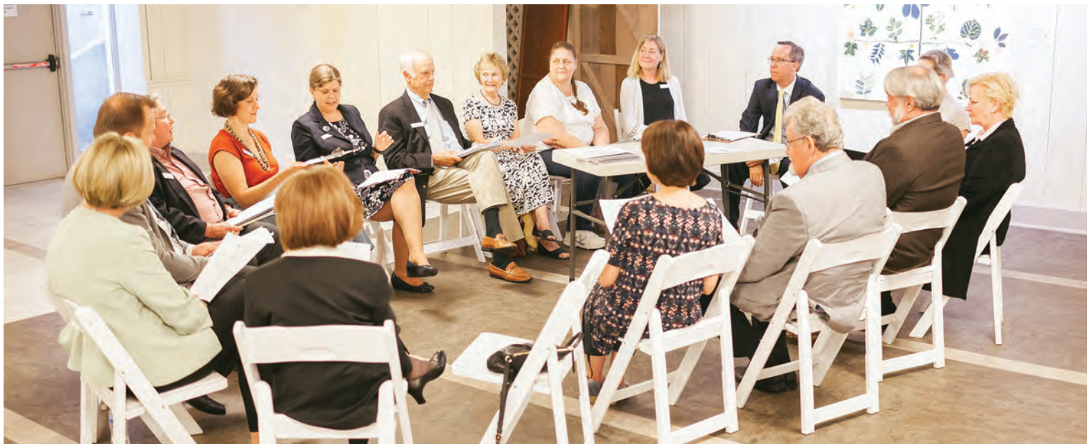
The Board of Governors electing officers in 2018.