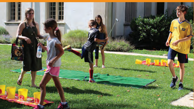
▲ Families playing lawn games during Midsommarfest.