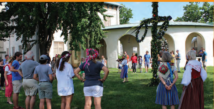
▲ Traditional dancing around the Maypole during Midsommarfest.