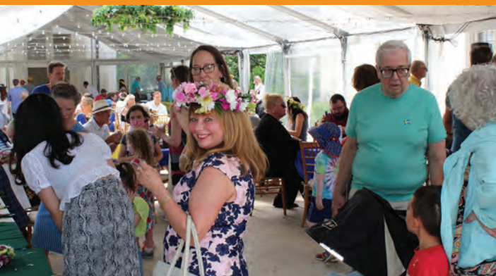
▲ Attendees under the tent at Midsommarfest.