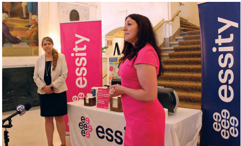
Press conference with Essity presenting donation.

Essity , is a leading Swedish global company in hygiene and health who have their North American headquarters here in Philadelphia. Essity generously donated hygiene and paper products to ASHM in preparation for the 2021 PHS Philadelphia Flower Show. The products provided covered the washroom needs for the thousands of daily visitors the museum received during the event. Along with 15 cases each of Essity's Tork® brand of bath tissue, paper towels and napkins, the donation also included several sanitizer stations. We would like to thank Essity for this wonderful donation which helped keep the museum safe and functioning during the Flower Show.