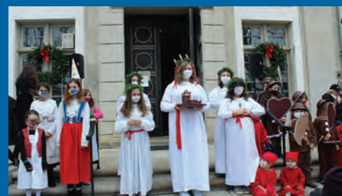
► Children singing during the Luciafest procession.