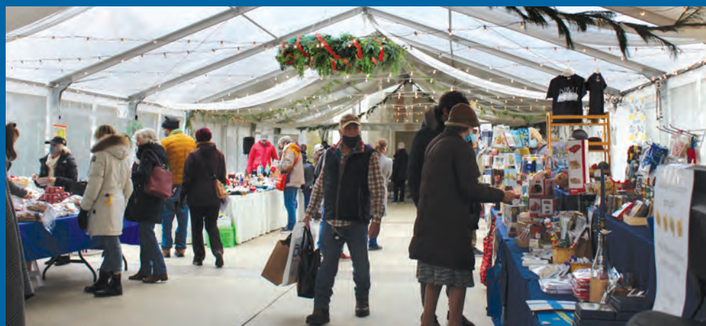
▲ Shoppers enjoying our annual Christmas Market.