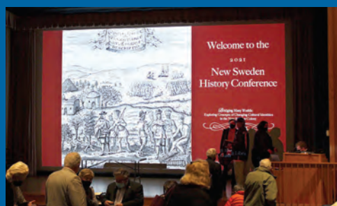
▲ The 2021 New Sweden History Conference was held in person at Winterthur Museum.