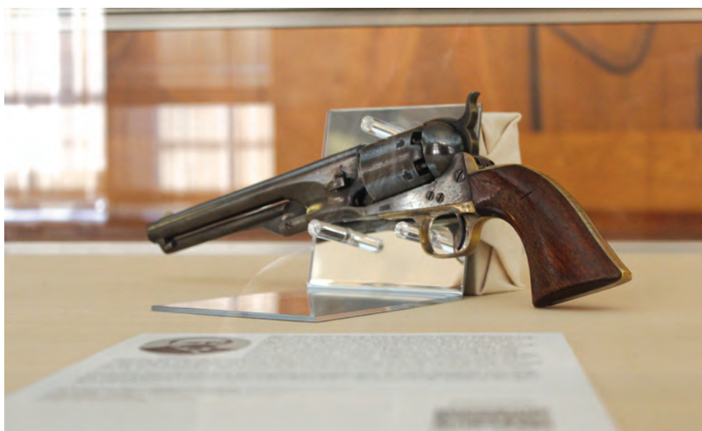
The Colt Revolver on view in the Chicago Room..