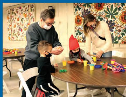
▲ A family enjoying crafts during December's Toddler Time.