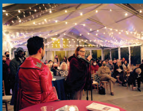
▲ The ABBA After Dark event with the Philly POPS!