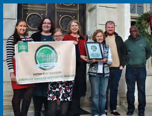
▼ Our staff proudly holding our new banner from the Metro naming us Best Museum in Philadelphia!