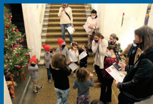
▲ Children dancing like tom-tom during our December Toddler Time.