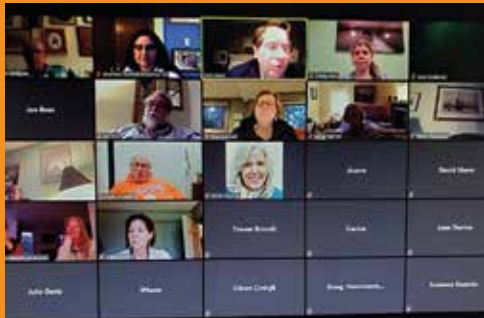
◀ Our first virtual program in April introduced participants to the Kalmar Nyckle exhibit Tall Ship Time Machine.