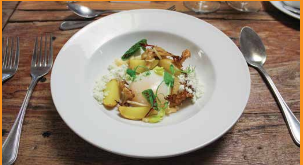
▲ One of the courses during the Nordic Tasting Menu Dinner including a poached egg, potatoes, mushrooms, and goat cheese.